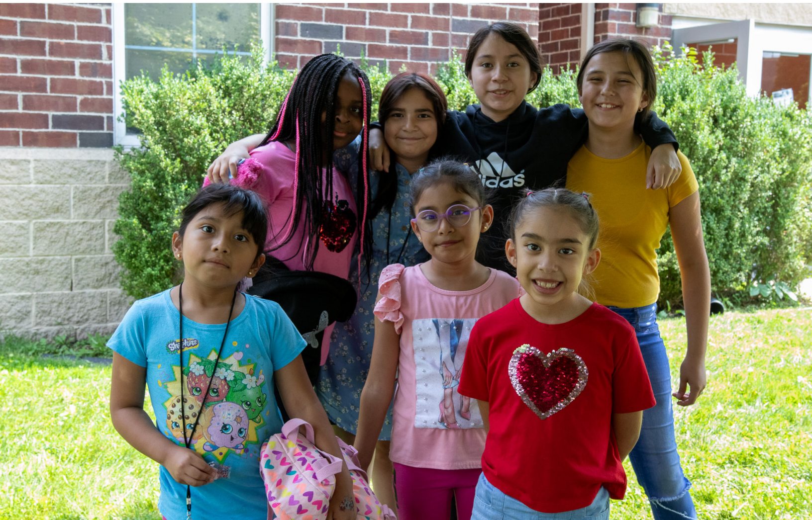
Photo: The 2023 Rise N' Shine day camp participants enjoy a fun-filled summer!